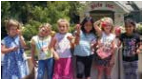
Have an Apple Healthy Day! Bragg giving apples to Girls, Inc.

From the Bragg Organic Farm: Our Orchards are producing healthy bounty of veggies and apples. Our harvest goes to local Schools, Food Banks, Boys & Girls Clubs, Unity Shoppe, and local non-profit organizations.